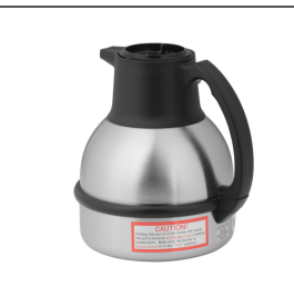
THERMAL CARAFE, BLK 1.83 L 1PK